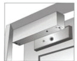
Effect of installation groove for Armature plate